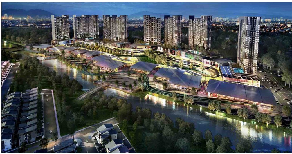
Canary Garden @ Bandar Bestari: (above, below) Prestige, elegance and an exclusive riverside resort lifestyle awaits at this integrated township which comprises a mix of residential, commercial and retail components.

A dwelling place refined by sophisticated modernity and chic facilities, your mind and body are constantly engaged by the refreshing elements of life that surround you. (right) Night scene of the two 25-storey apartment blocks.