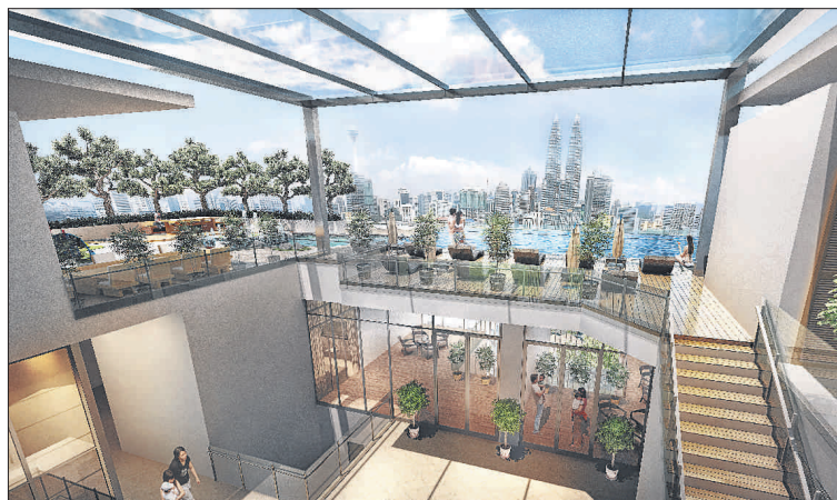
18 Madge @ Ampang: (above, left and below) KSL Holdings also has development activities in Klang and Ampang, Kuala Lumpur.